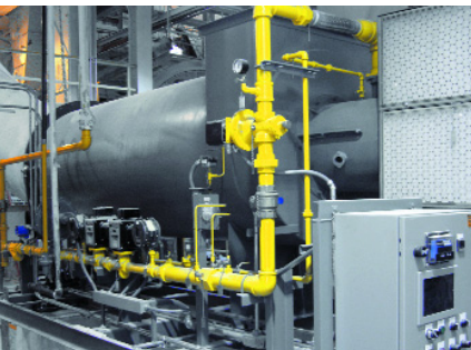
Mill Heater Assembly

From burner and control systems to complete calcining kettles and hot gas generators we deliver well defined solutions to meet your specific needs.